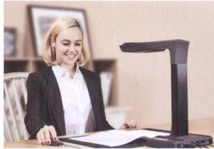
HR / Administration