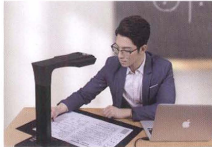
University / School