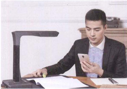
Law / CPA Firm

Scan book, magazine, drawing, picture, blueprint, receipt and so on.