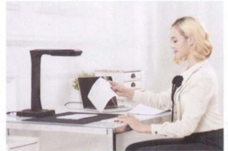
Accounting / Finance