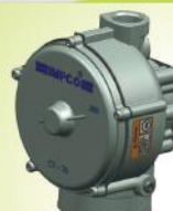
Gas Air Mixer