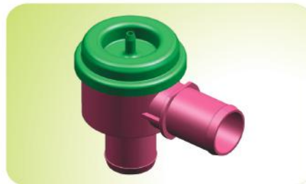
Dump valve for improved Block loading