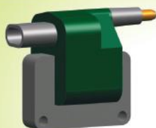
High Tension Ignition Coil