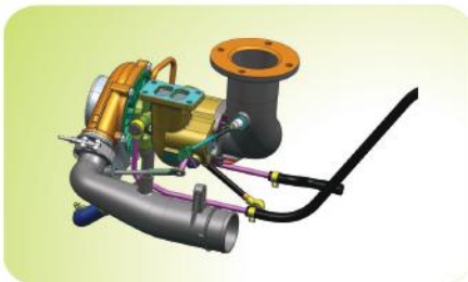
Water Cooled Turbocharger for maximum power output