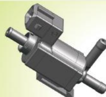
Fuel Control Valve