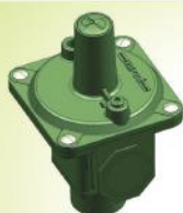
Zero Pressure regulator